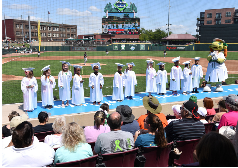
Children who recently turned five years old that graduated from the program were recognized and celebrated during the game

Imagination Library Day at the Dayton Dragons' stadium was a huge success. The Dayton Dragons expressed their support for literacy and our Montgomery County Imagination Library program by celebrating local children who graduated from the initiative. As of December 2023, an astonishing 11,342 children graduated from the program, marking a significant milestone in our program. We are excited to continue promoting our love for reading and connecting the children and families in our community to books.